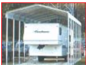
RV & Boat Storage