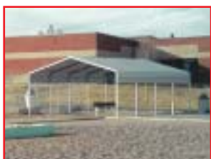
Shade & Shelter