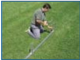
Step 1. Assemble the base rails.