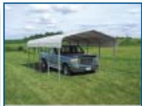
Step 4. Enjoy!