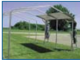
Step 3. Attach the siding to the metal frame.