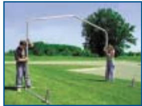
Step 2. Assemble the trusses Attach the trusses to base rails.